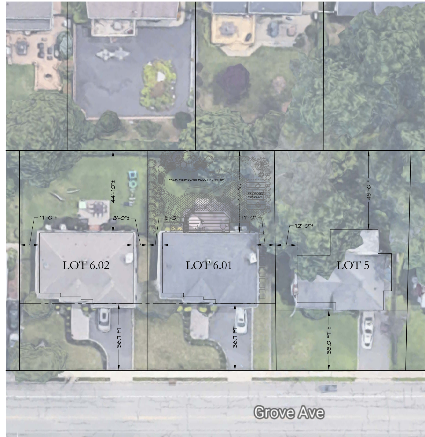
1 CONTEXTUAL SITE PLAN NOT TO SCALE IMAGE DOWNLOADED FROM GOOGLE MAPS

APPLICABLE CODES: INTERNATIONAL RESIDENTIAL CODE 2018 - NEW JERSEY EDITION UNIFORM CONSTRUCTION CODE NATIONAL ELECTRIC CODE 2017 NATIONAL STANDARD PLUMBING CODE 2018 INTERNATIONAL MECHANICAL CODE 2018 INTERNATIONAL FUEL GAS CODE 2018 INTERNATIONAL ENERGY CONSERVATION CODE 2018 CODE REVIEW: EXISTING USE GROUP: R-5 "SINGLE FAMILY DWELLING" EXISTING CONSTRUCTION TYPE: 5B